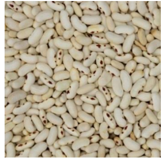
White Candle Gaucho dry bean