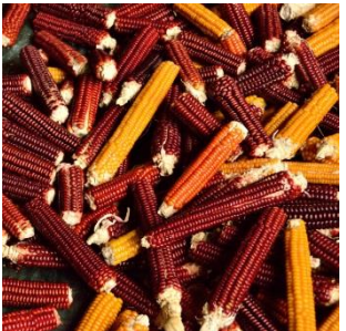
Landmark Flint corn