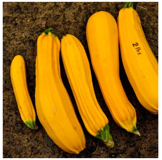
Goldini Zucchini summer & drying squash