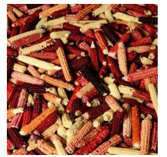
Magic Manna flour corn