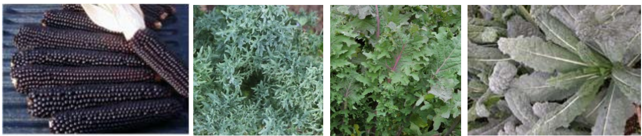
Dakota Black Pop popcorn