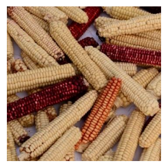
Pancake White Manna flour corn