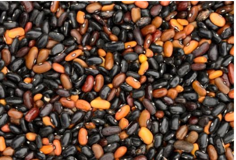
Beefy Resilient Grex dry bean