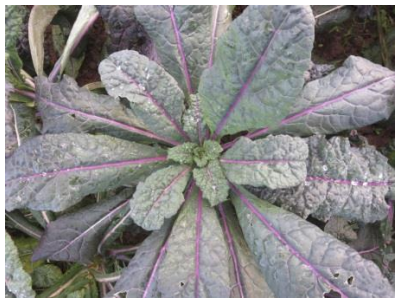
Dazzling Blue Lacinato kale (B. oleracea)