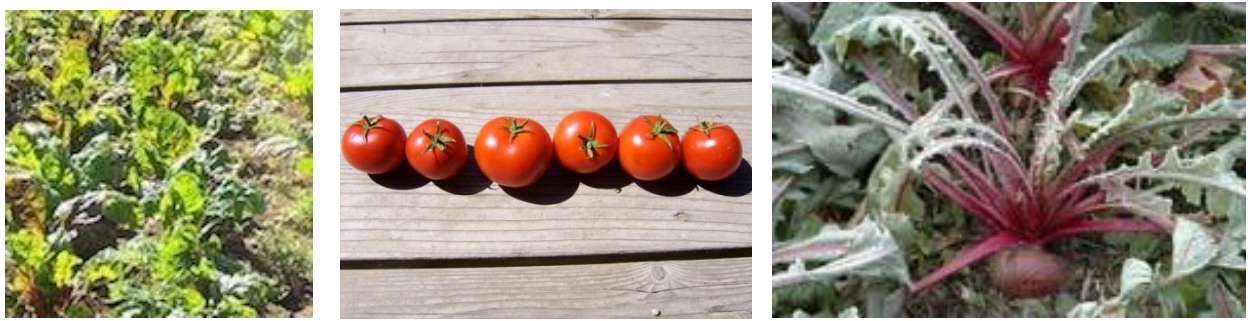
Prismatic Rainbow Swiss chard