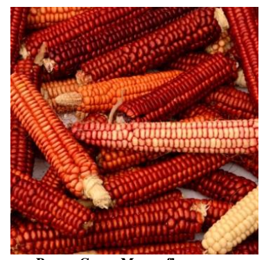
Brown Gravy Manna flour corn