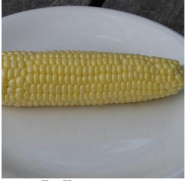
Top Hat sweet corn