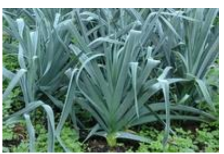
Belgian Breeders Winter Mix leeks