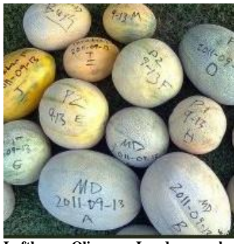
Lofthouse-Oliverson Landrace melon