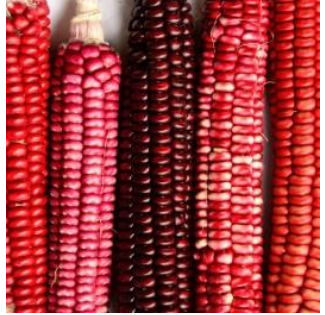
Parching Red Manna flour corn