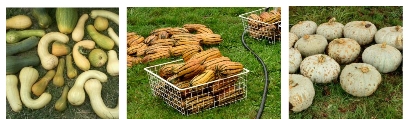
Lofthouse Landrace Moschata