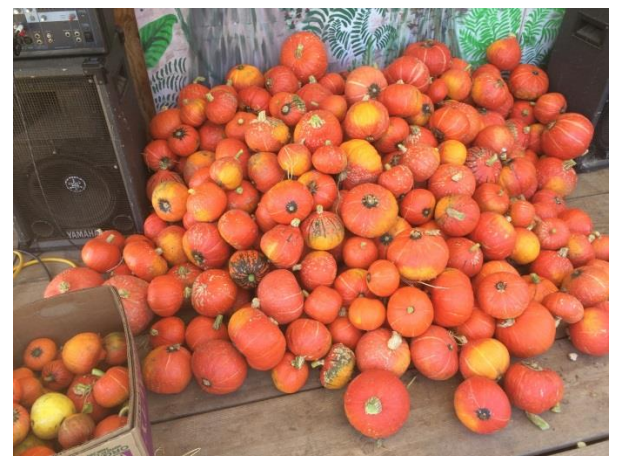
Sundream winter squash