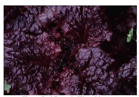
Hyper Red Rumple Waved lettuce