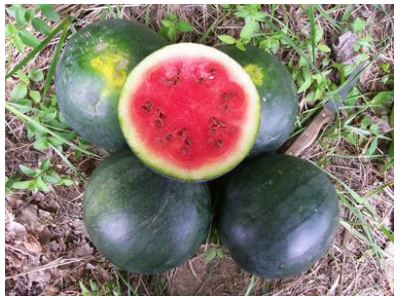
Blacktail Mountain watermelon