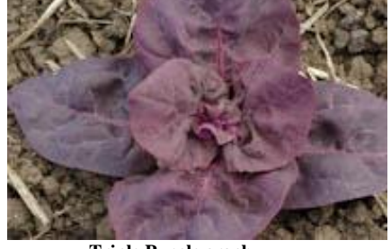
Triple Purple orach