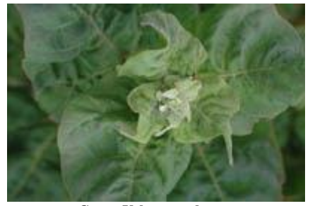
Green Velvet orach