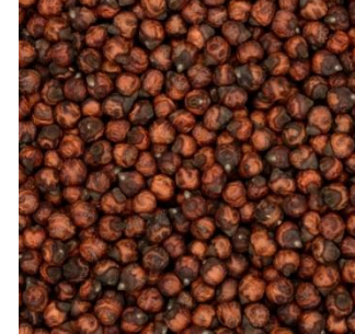
Hannan Popbean garbanzo