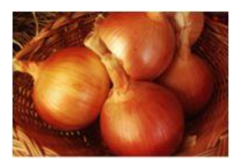
Dakota Tears onion