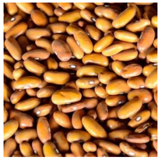
Beef-Bush Gold Resilient dry bean