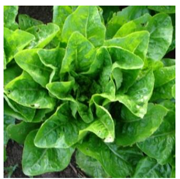
Emerald Fan lettuce